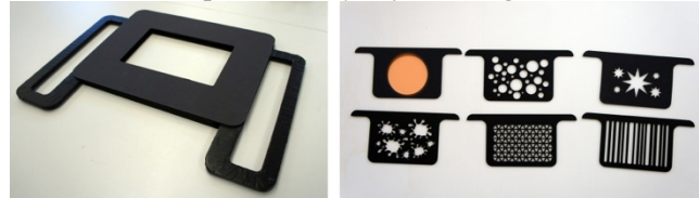
Figure 2a and 2b. Magic Frame and Filters

Workshop Two involved an initial reflection activity followed by a task. We first invited the pupils to each look at their individual Project Books and their ‘favourite’ photo from the previous Portrait Task (that we had inserted). Building on our analysis of Workshop One, we invited discussion on ‘ways of looking’ as part of photographic practice, including composing images and using the ‘Zoom’. The subsequent task involved the pupils working again in pairs – this time orchestrated by Jane – and taking photos of each other. Each pair was invited to utilise the bespoke prop that we had designed for this task, called a ‘Magic Frame’ (Figure 2a). This prop was intended to help the pupils compose photos and, specifically, draw attention to the practice of ‘framing’ a subject to capture. Magic Frames were accompanied by ‘Magic Filters’ that could be slotted in to the Frames to change ‘ways of looking’ for capture (Figure 2b).