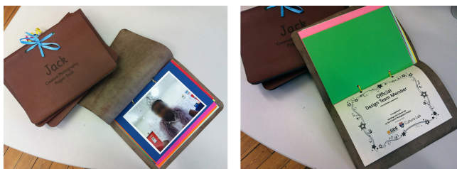
Figure 1a and 1b. Creative Photography Project Books

Alongside these props, we made a ‘Project Book’ for each pupil; again, bespoke by design and leather-bound, these aimed to serve as albums containing photos that the pupils had taken, to be edited after each workshop (Figure 1). Also, information about each workshop activity could be added to the Books incrementally. We planned to use these Books to invite pupils to reflect back on what they had done during each workshop to inform our research. Digital cameras were also provided at each workshop for the pupils to use in conjunction with activities.