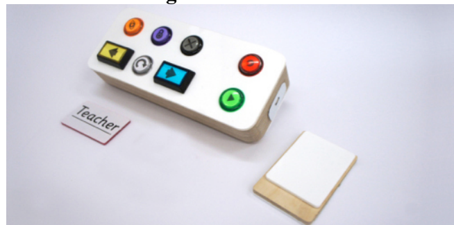
Figure 4. Photo-sorting Console with RFID card & reader

The first of these elements, the Photo-sorting Console (Figure 4), controls a software application running on the pupils’ classroom PC. This application shows pupils a number of photos on the peripheral PC monitor screen, which are loaded from an SD card inserted by their teacher. The physical controller, designed for visible, collaborative use in small groups or pairs, consists of a number of physically accessible arcade-style buttons, that pupils can press to browse photos – by pressing the left (yellow) and right (light blue) buttons, and rotate photos – by pressing the rotate (white) button. Pupils can also express their opinion about a photo, by pressing: the orange button to ask for the photo to be