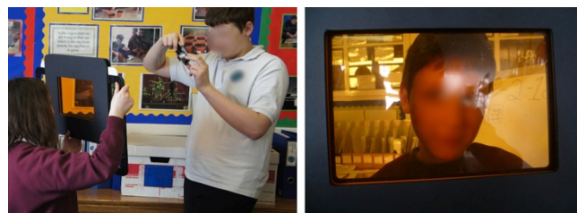
Figure 3a and 3b. Magic Frames in Use

Workshop Two involved an initial reflection activity followed by a task. We first invited the pupils to each look at their individual Project Books and their ‘favourite’ photo from the previous Portrait Task (that we had inserted). Building on our analysis of Workshop One, we invited discussion on ‘ways of looking’ as part of photographic practice, including composing images and using the ‘Zoom’. The subsequent task involved the pupils working again in pairs – this time orchestrated by Jane – and taking photos of each other. Each pair was invited to utilise the bespoke prop that we had designed for this task, called a ‘Magic Frame’ (Figure 2a). This prop was intended to help the pupils compose photos and, specifically, draw attention to the practice of ‘framing’ a subject to capture. Magic Frames were accompanied by ‘Magic Filters’ that could be slotted in to the Frames to change ‘ways of looking’ for capture (Figure 2b).